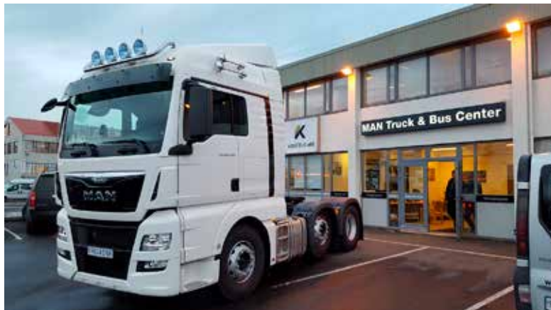
MAN TGX 26.480 6x2/4

The VW Crafter van was bought new from Hekla hf. and is used for smaller deliveries and express deliveries in the greater Reykjavik area and to transportation centres. It is therefore no less important, as it is vital that customers can count on the swift delivery of smaller consignments.