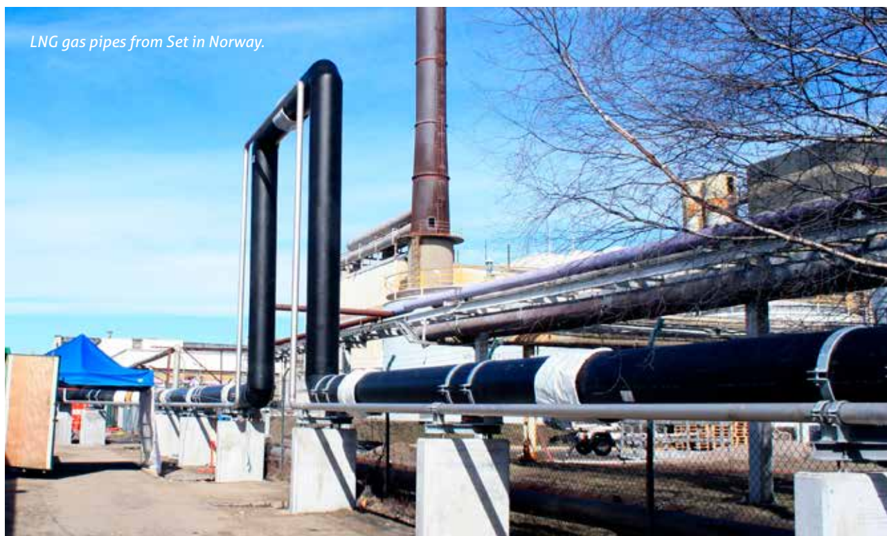
LNG gas pipes from Set in Norway.