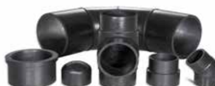
PE welding fittings and valves