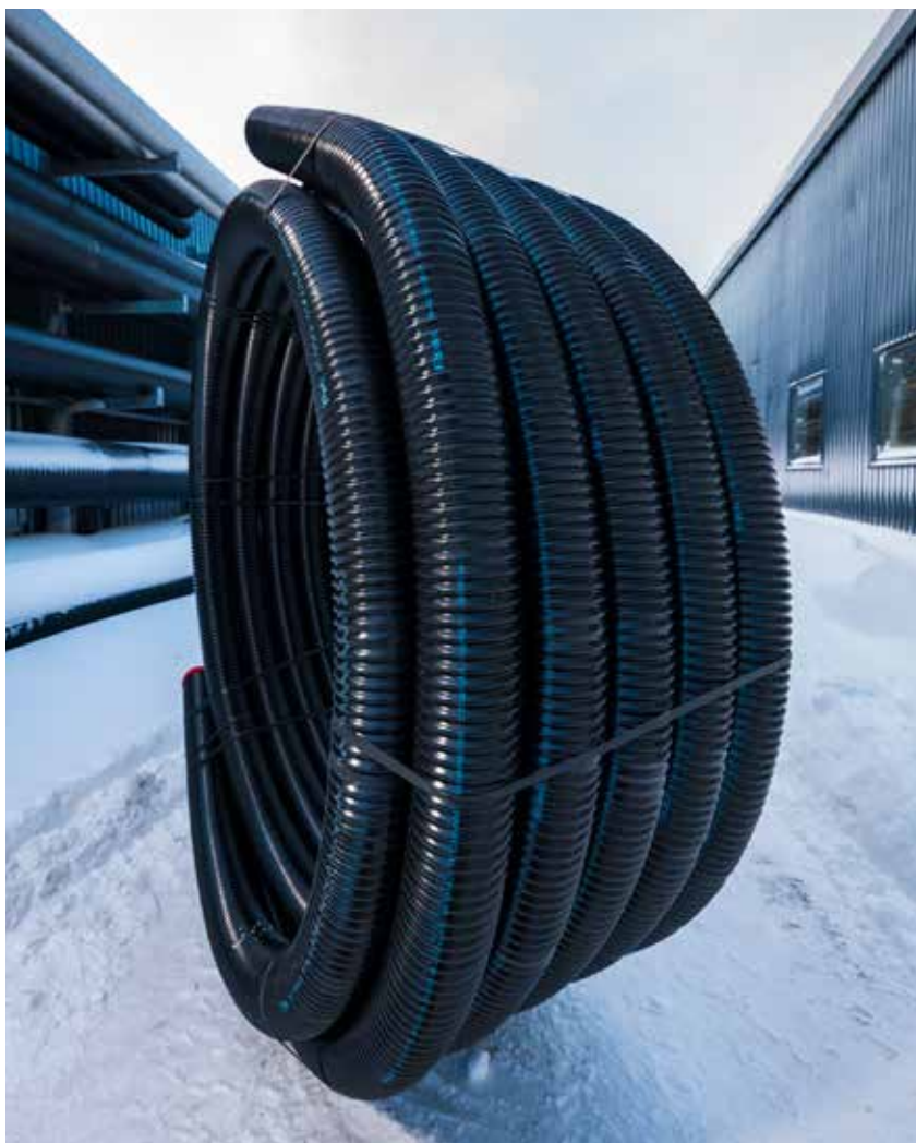
The Elipex Premium pipe is flexible and has good insulation.

Five years ago, Set's technicians decided to implement a new methodology in the manufacturing. This experiment yielded significant results in late 2014. Remarkable results were achieved as regards the insulation value of the pipes. The consequent question was how to achieve more flexibility in pipes that were otherwise rather rigid. In this regard, Set's technicians managed to define the factors that were worth altering, and it was soon decided to change the material and shape of the