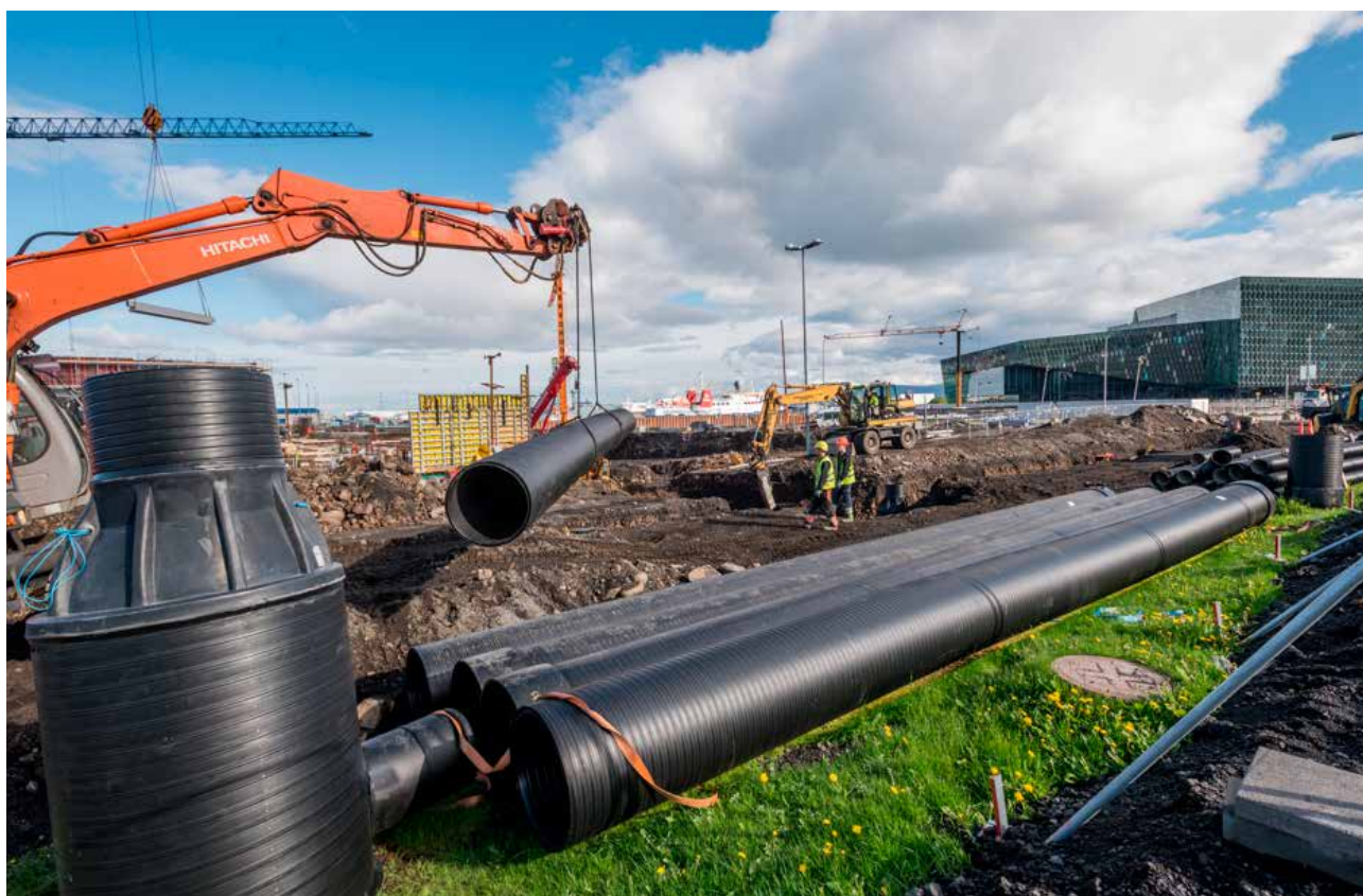
Construction in central Reykjavik. Weholite pipes in the foreground.

Set has a wide-ranging product range in the drainage field and has met growing market demand with comprehensive product lines of materials with all attendant bonding and joining materials, either manufactured by Set or one of the company's technically advanced partners.