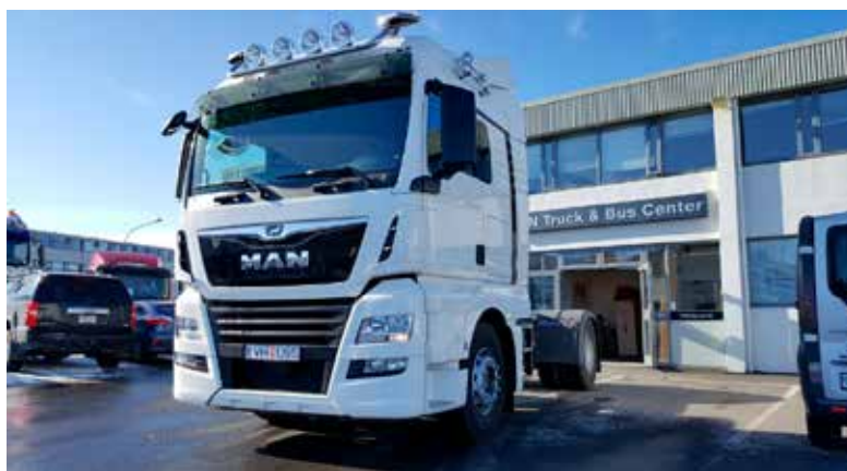
MAN TGX 18.460 6x2/4