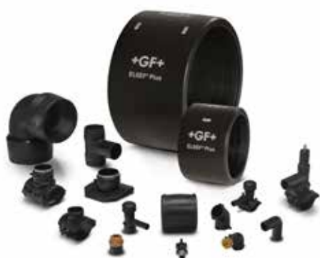
Elgef PE electrical welding fittings