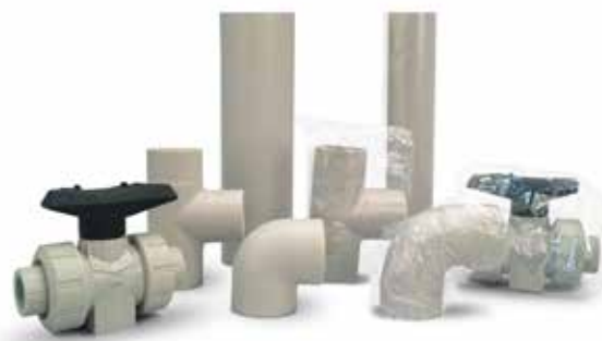
PP welding fittings and valves