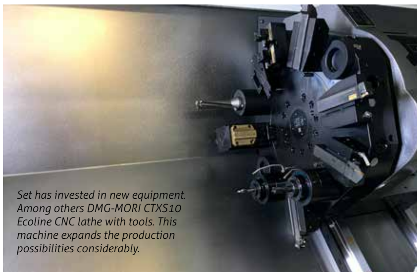
Set has invested in new equipment. Among others DMG-MORI CTXS10 Ecoline CNC lathe with tools. This machine expands the production possibilities considerably.

Many other types of equipment could be mentioned. The building of plastic welders to manufacture fittings has been highly successful, for instance.