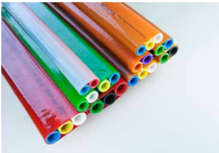
The so-called Flatliner casing pipe for fibre-optic cables has multiple ducts in a single row, encased in a protective outer shell. It has been increasingly popular in fibre-optic markets in Europe and other countries.

The successful collaboration between the companies has enhanced Set's position in sales and technical capabilities, combining Set's basic processing of simpler products in bulk and GM Plast's customised solutions.