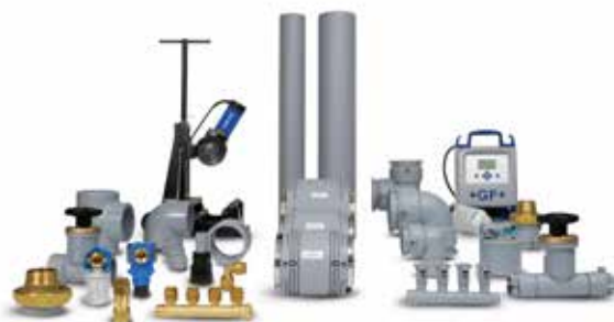
Instaflex PB electrical welding fittings